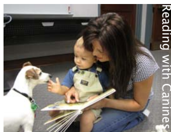
Reading with Canines