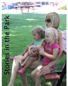
Stories in the Park