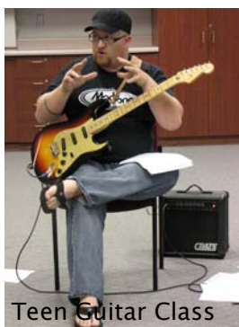
Teen Guitar Class