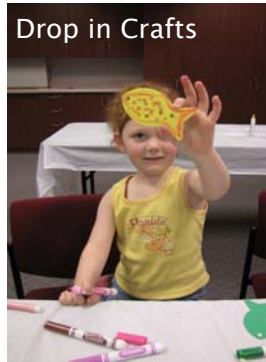
Drop in Crafts

See more photos on www.flickr.com under "Warsaw Community Public Library".